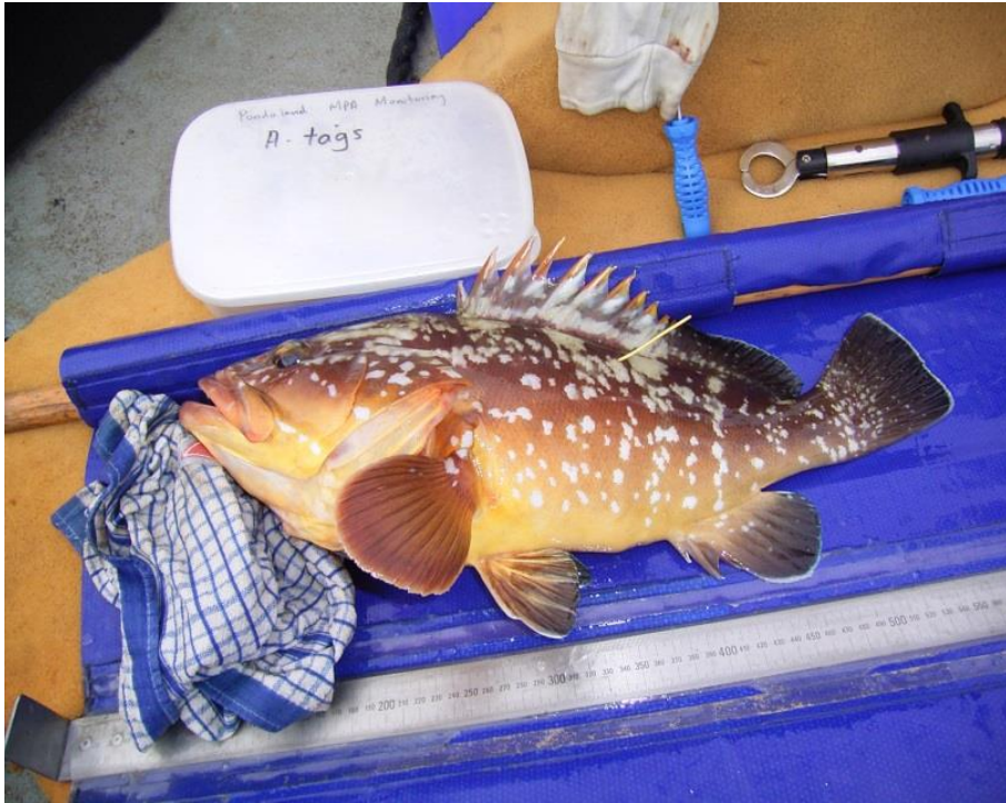
Figure 5: A tagged (visible by the yellow marker just below the dorsal fin) yellowbelly rockcod that has been recaptured nine times over four-years on the same reef in the Pondoland Marine Protected Area.