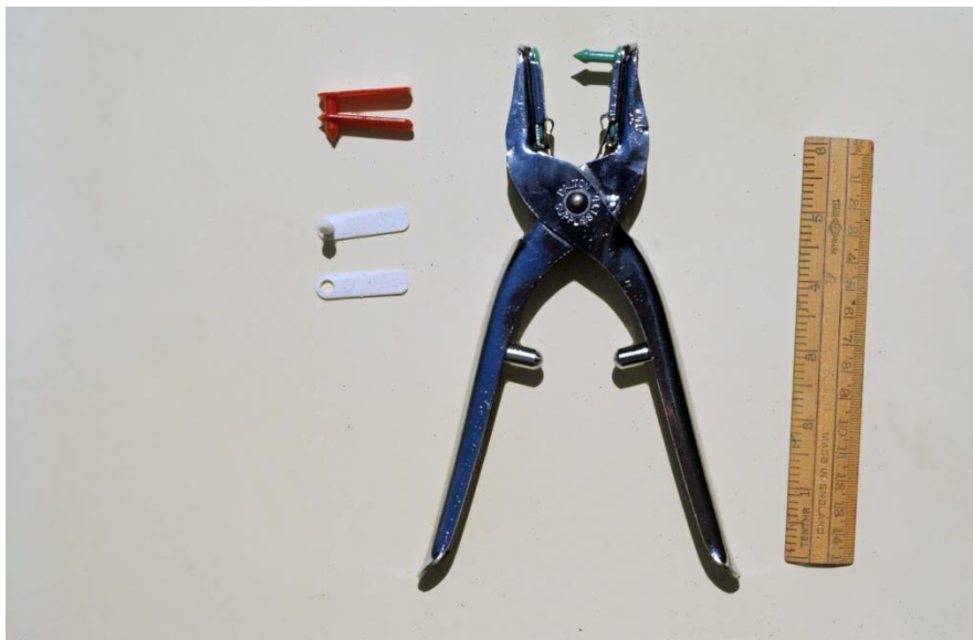
Figure 2: Modified livestock ear-tags used to tag fish in the early days of the ORI-Cooperative Fish Tagging Project.